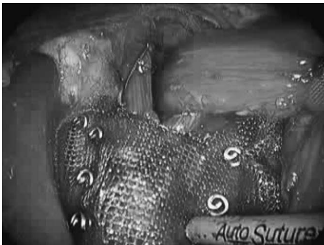
Fig. 1. Operative view of TiMesh repair. After primary crural closure, the hiatoplasty is reinforced with TiMesh. The mesh is fixed to the diaphragmatic crura with titanium helical screws.